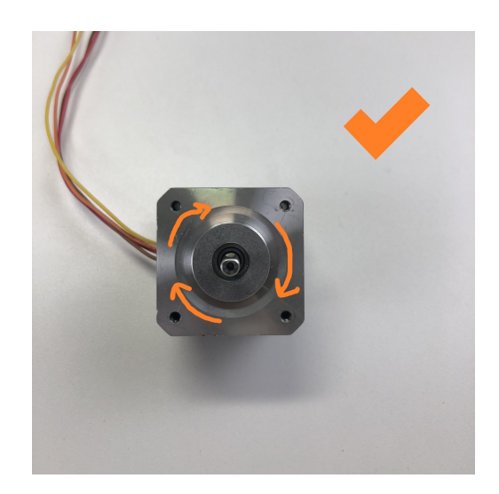
PROPERLY FUNCTIONING STEPPER MOTOR Rotates till stalled out by force, will not reverse without input from software.

When the stepper motor is attached to a coupler, or leadscrew, it may only move slightly back and forth in opposite directions, as anything putting resistance on the stepper motor shaft will cause it to reverse direction without input from the software. We can use this to our advantage when testing a bad motor.